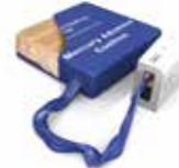
Dyna-Form Mercury Advance Alternating Cushion 152kg Weight Limit. 19" or 22" seat widths. Risk Category: Very High Risk. Order Code: 1101