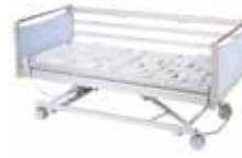
Lago Hi/Lo Acute Care Bed Frame 230kg SWL. Order Code: 0112