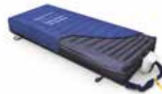
Dyna-Form Air Suresse Dynamic Mattress 254kg Weight Limit. Risk Category: Very High Risk. Order Code: 0416