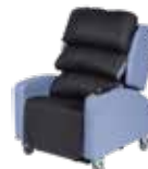
Pro-Axis Riser Recliner Chair 120/140kg SWL. 19" or 22" seat widths. Order Code: 0505