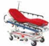
Inthes Trolley Bed 240kg SWL. Order Code: 0115