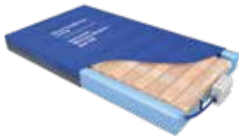
Mercury Advance Bari WA 380kg Weight Limit. Risk Category: Very High Risk. Mattress Order Code: 0415 Pump Order Code: 1209