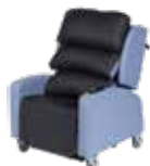
Pro-Axis Riser Recliner Chair 444kg SWL. 34" seat width. Order Code: 0503