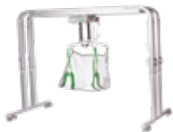
Ultra-Twin Gantry Hoist 400kg SWL. Includes re-usable sling. Order Code: 0602