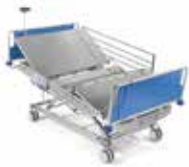
Pro Axis 2 Bed Frame 400 & 500kg SWL. Order Code: 0113