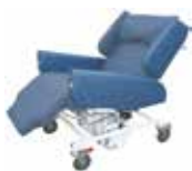
Hi-Lo Tilt-In-Space Bariatric Day Chair 300kg SWL. Order Code 0508