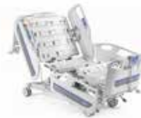
Gamma 3 Bed Frame 260kg SWL. Order Code: 0114