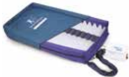
Dyna-Form Power Turn Elite Lateral Rotation Mattress 453kg Weight Limit. 4-foot. Risk Category: Very High Risk. Order Code: 0413