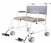
Freeway T100 Bariatric Shower Chair/Commode 350kg SWL. 28", 30" or 32" seat width options. Order Code: 0706