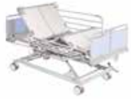
Olympia Bariatric Bed Frame 500kg SWL. Order Code: 0111