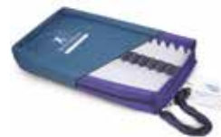
Dyna-Form Power Turn Elite Lateral Rotation Mattress 220kg Weight Limit. 3-foot. Risk Category: Very High Risk. Order Code: 0413STD