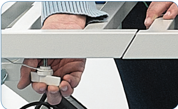
Fixing together of the two 1/2 bases by means of through-tube rondos