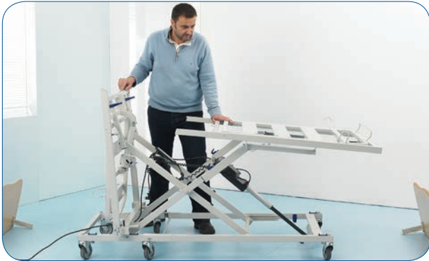
Locking of the 1/2 base with the legs horizontal.