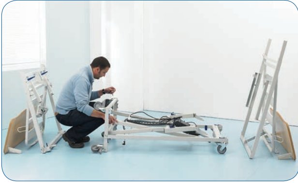
Conversion of self-supporting trolley to become the chassis