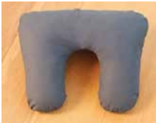
Weighted Neck Support

To fit the headrest, simply position the headrest over the top of the back of the chair, with the weight hanging down the rear of the back module. Then position the headrest to suit the user, the weight will hold the headrest in the correct position.