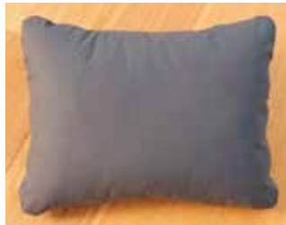
Weighted Head Pillow