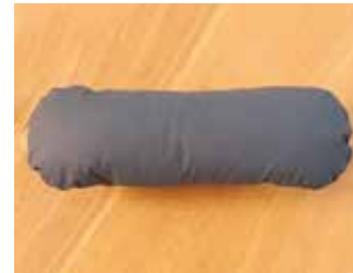
Weighted Neck Cushion