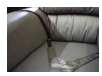
Place the ends of the straps over the arms of the chair ready for the occupant to transfer to the chair.

Sit the occupant into the chair with their pelvis firmly back in the seat and their buttocks on the back edge of the Pelvic Positioner.