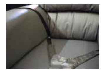
Place the ends of the straps over the arms of the chair ready for the occupant to transfer to the chair.

Sit the occupant into the chair with their pelvis firmly back in the seat and their buttocks on the back edge of the Pelvic Positioner.