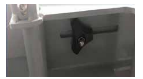
To adjust the seat length, ensure the chair is unoccupied. Go to the rear of the chair and undo the butterfly knob under the seat module.

If the legrest is generally used elevated, then the optimum seat length is when the calf lightly touches the legrest cushion.