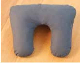
Weighted Neck Support

To fit the headrest, simply position the headrest over the top of the back of the chair, with the weight hanging down the rear of the back module. Then position the headrest to suit the user, the weight will hold the headrest in the correct position.