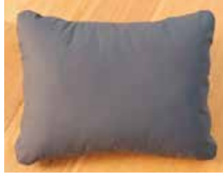
Weighted Head Pillow