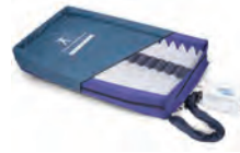
Dyna-Form Power Turn Elite Lateral Rotation Mattress 220kg Weight Limit. 3-foot. Risk Category: Very High Risk Order Code: 0413STD