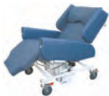
Hi-Lo Tilt-In-Space Bariatric Day Chair 300kg SWL Order Code 0508