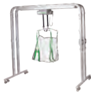
Ultra-Twin Gantry Hoist 400kg SWL Includes re-usable sling Order Code: 0602