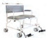
Freeway T100 Bariatric Shower Chair/Commode 350kg SWL. 28", 30" or 32" seat width options Order Code: 0706