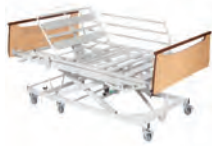
XXL Xpress Bariatric Care Bed 270kg SWL Order Code: 0110