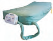
Quattro Sentinel 370kg SWL Order Code: 0304