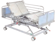
Olympia Bariatric Bed Frame 500kg SWL Order Code: 0111