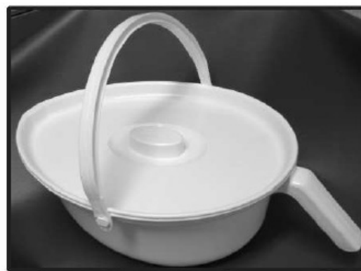
Handle raised for carrying