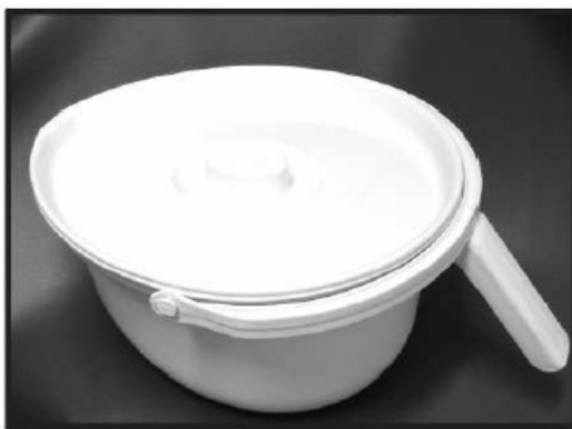
Handle folded down