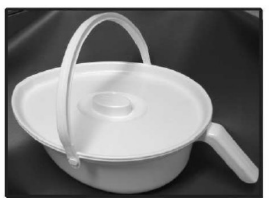
Handle raised for carrying