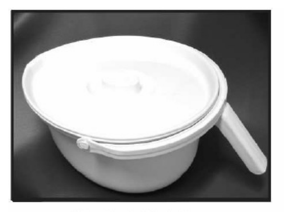
Handle folded down