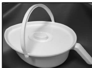
Handle raised for carrying