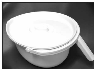
Handle folded down