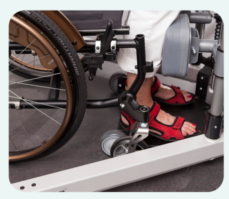
If you choose a walker with electrically adjustable widening you are also choosing increased flexibility. You can get close to the patient regardless of wheelchair or chair width. Also note that in most cases the platform will fit between a wheelchair's front castors.