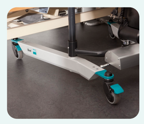
The new Bure DB now has lower ground clearance, which makes it significantly easier to fit under beds and thus get closer to the user. When fitted with 75mm castors, Bure DB is especially low.