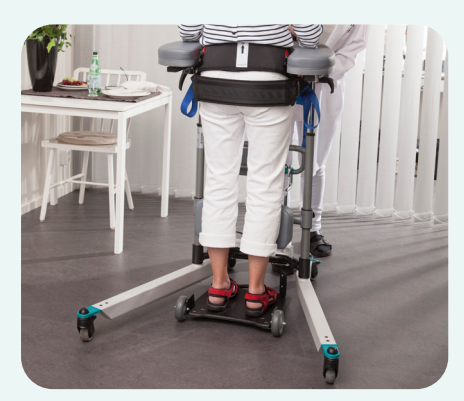
The platform is an excellent addition when you want to use the walker for mobility, standing up and patient transits. The platform is narrow enough for use on most wheelchairs.