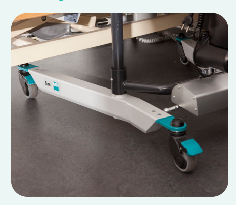
The new Bure DB now has lower ground clearance, which makes it significantly easier to fit under beds and thus get closer to the user. When fitted with 75mm castors, Bure DB is especially low.