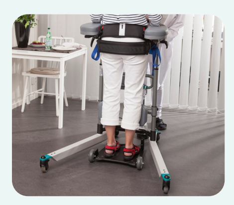
The platform is an excellent addition when you want to use the walker for mobility, standing up and patient transits. The platform is narrow enough for use on most wheelchairs.