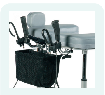
Soft basket with attachment Basket with attachment has room for all the important stuff.

PU foam armrest pads can be specified with the order or selected retroactively. The pads have no perforations or edges that accumulate dirt. An excellent alternative where high standards of hygiene management are demanded. Please note that the armrest pads PU will add 5cm on the overall width compared to measures given.