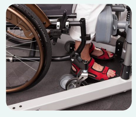
If you choose a walker with electrically adjustable widening you are also choosing increased flexibility. You can get close to the patient regardless of wheelchair or chair width. Also note that in most cases the platform will fit between a wheelchair's front castors.