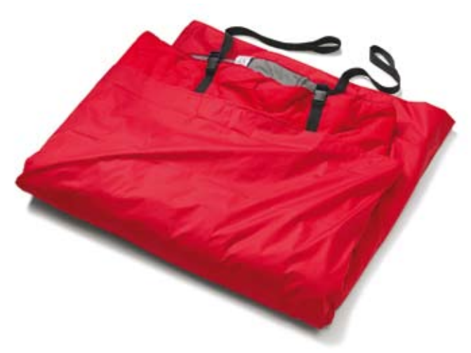
For positioning - EasySlide 1430