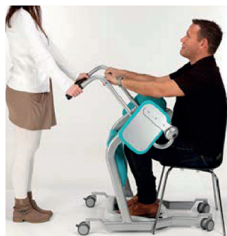
2. Manoeuvre up to the care recipient.