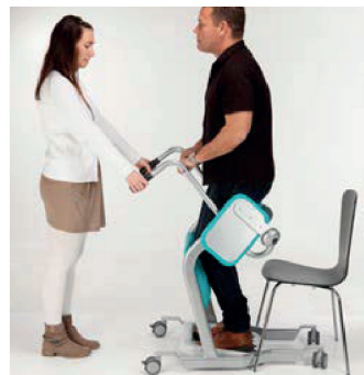
4. Place the Mover Plus so the care recipient can easily place his or her feet on the step and his or her knees/shins against the shin support. Let the care recipient take hold of the crossbars/handles however he or she wishes.