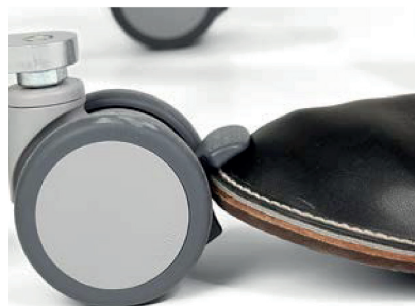
Release the brakes