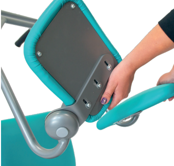
1. Fold up the two half-seats.