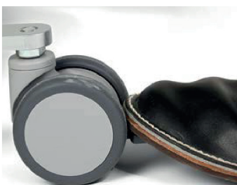
3. Lock the brakes