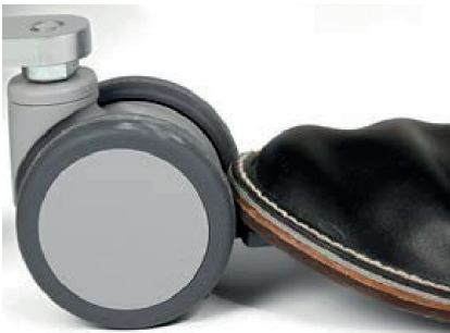
Lock the brakes