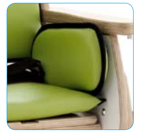
25mm Side Pad (Pair) 135-X635-AA 50mm Side Pad (Pair) 135-X654-AA