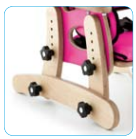
Stabilisers (Pair) 135-X604