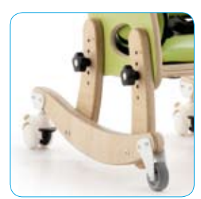
Ski with Castors (Pair) 135-X610