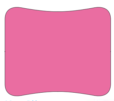
2 Person Table 650x500mm 135-X700-AA