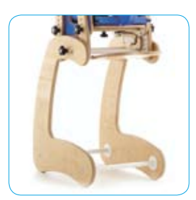
High Seat Frame (Size 1 only) 135-1630