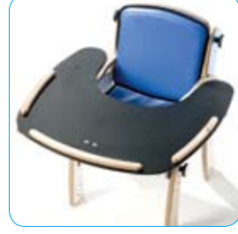
Activity Tray 135-X620 Tray Pad (Not shown) 135-X656