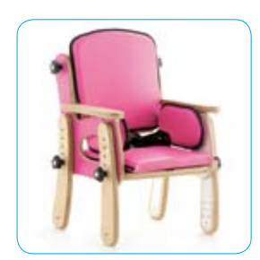
Seat (including Lap Strap)