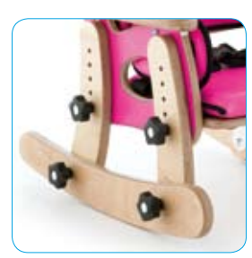
Rocker (Pair) 135-X604