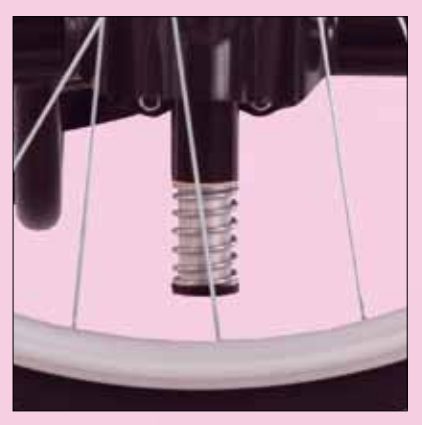
Mobility chassis: Unique wheel suspension system