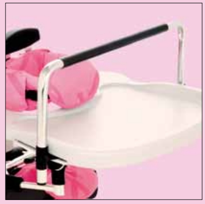
7. Contoured large activity tray