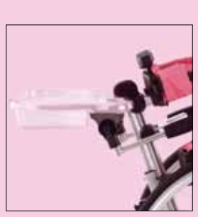
129-626 Transparent activity tray 129-701 Spine cap cover