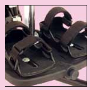
117-781 Sandals - small 117-782 Sandals - medium