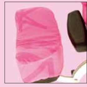
118-753 Contoured headrest +01 Green +02 Orange +03 Blue + 04 Pink