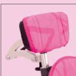
120-792 Flat headrest cushion +01 Green +02 Orange +03 Blue +04 Pink