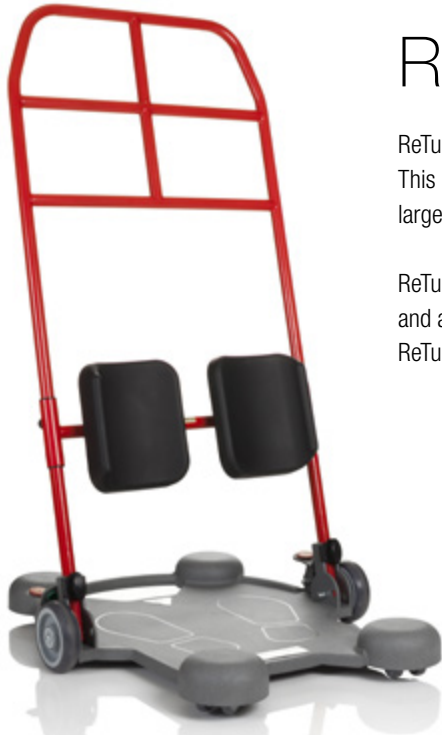
Item No. 7600, ReTurn7600

ReTurn7600 also has lower-leg supports that are adapted for these users, and a rising ladder that is both higher and wider than the ladders on ReTurn7500i and ReTurn7400.