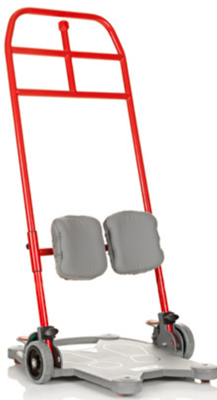
ReTurn7500i suits most adult users

ReTurn7500 is thus the original and a success story that is sure to become a classic. To enable solutions for more situations while at the same time meeting the needs of more types of users, we have developed several more models of ReTurn. We have also made further refinements to ReTurn7500. However, the basic principle behind ReTurn remains the same: the user's own strength and ability must be utilised and improved. All models of ReTurn therefore have a couple of important features in common: they help to activate the user and they encourage the user's natural patterns of movement. They also give users the opportunity to regularly raise themselves to a standing position. Quality of life can be something as simple as the possibility to use one's own strength and functional ability.