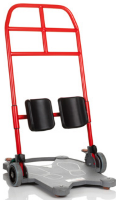
ReTurn7400 is ideal for shorter adults and children