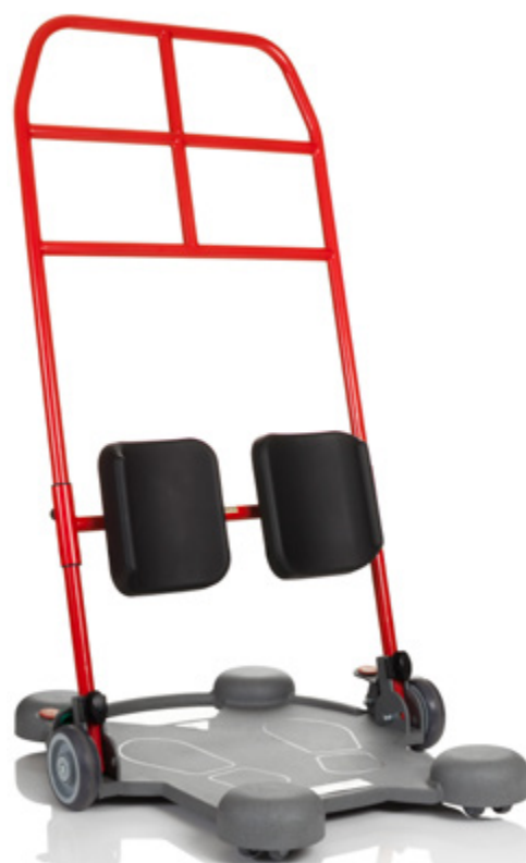
ReTurn7600 has been developed for larger and heavier users weighing up to 205kg/32 stone