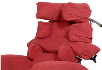
Split-wing headrest adjustment