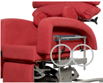
Arm height adjustment