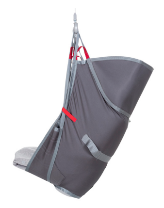
Max load: 300kg/660lbs

AmpHBSling is easy for the caregiver to apply and it gives the patient a feeling of security. It features leg sections, which means that the patient does not sit on the sling. Instead, the sling provides support from the tailbone up over the head and under the legs. AmpHBSling has been designed for the most common lifting situations, even where a sling without separate leg sections is preferred; e.g., when lifting a patient with high double leg amputations.