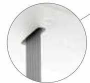
Night light for increased convenience and security