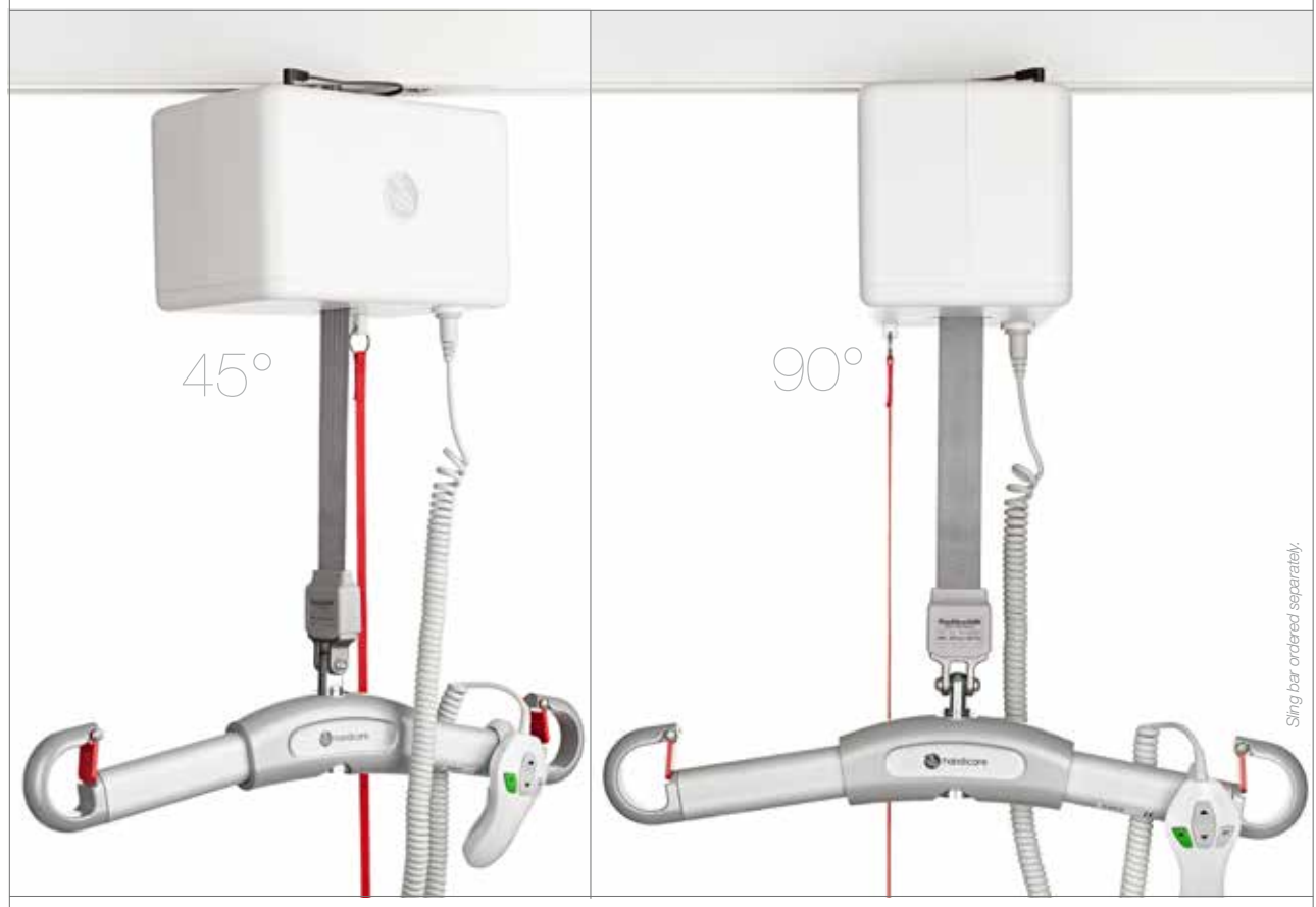
With QuickTrolleySystem, the ceiling lift unit and the lift strap can easily be preset to an angle of 45 or 90 degrees towards the rail for smooth and convenient transfers of users from one room to another.