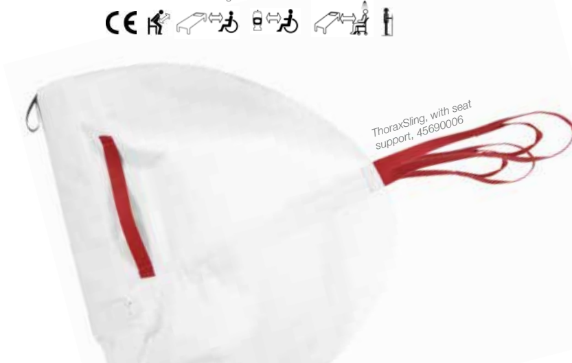
ThoraxSling, with seat support, 45690006