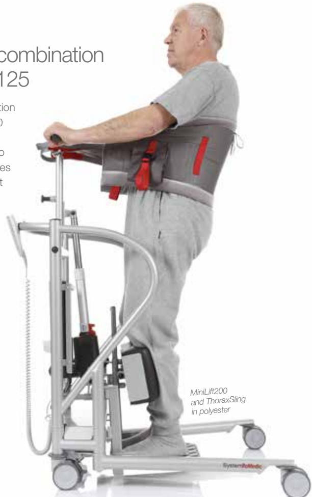
MiniLift200 and ThoraxSling in polyester