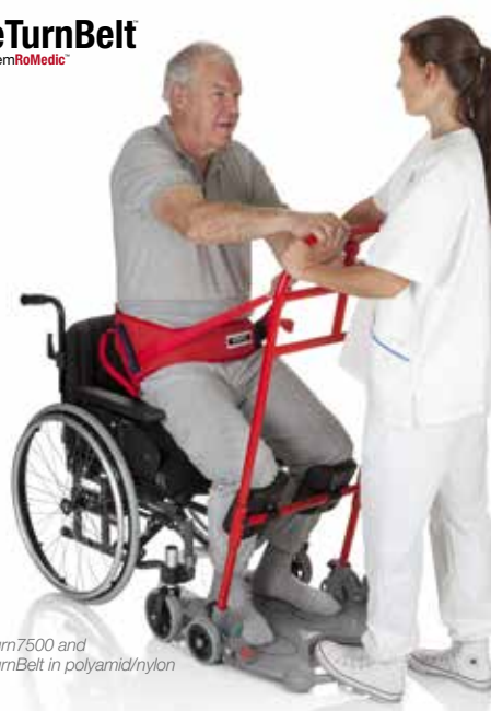
ReTurn7500 and ReTurnBelt in polyamid/nylon

The patented* SystemRoMedic™ ReTurnBelt is an excellent complement to Handicare's ReTurn transfer platforms. For users with weak legs and requiring extra support.