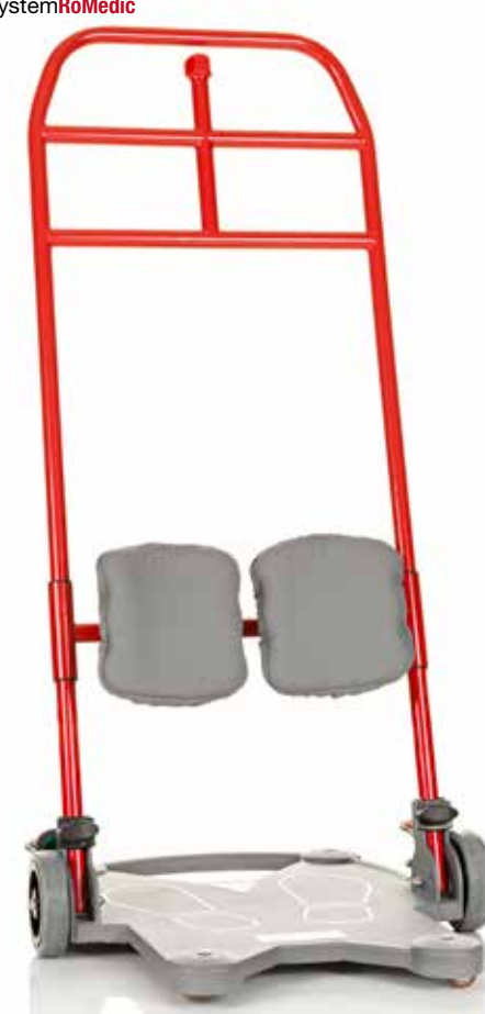
Item No. 7500i, ReTurn7500, extra padding for lower-leg supports are included as standard