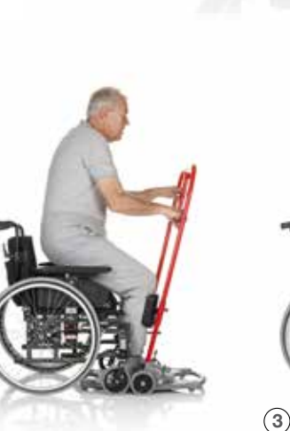
The user lifts the feet somewhat and places them on the base plate markings. The base plate is then rolled in under the bed, chair or wheelchair, so that the lower legs are supported by the lower-leg supports. When ReTurn is in the right position, the caregiver locks the wheels.

Throughout the entire sit-to-stand procedure, the caregiver must have one foot on the base plate to provide counterweight.