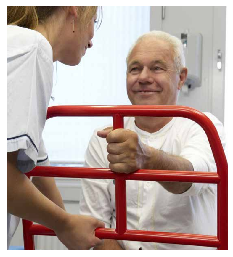
ReTurn7500 has a rising ladder of standard height and is appropriate for most adult users. ReTurn7500 is also available in a new version on which the rising ladder (patent pending**) has an opening for quick and easy hooking of ReTurnBelt. Both versions of ReTurn7500 are intended for users weighing max. 150 kg/330 lbs.

ReTurn7500 and ReTurn7400 have the same stable base plate, but rising ladders with different heights. The common base plate makes it possible to easily change between low and standard-height ladders to cover a broader range of needs and make best use out of the product.